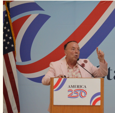
Cabinet Secretary Randall Reid-Smith addresses the America 250 Conference in Washington, DC.