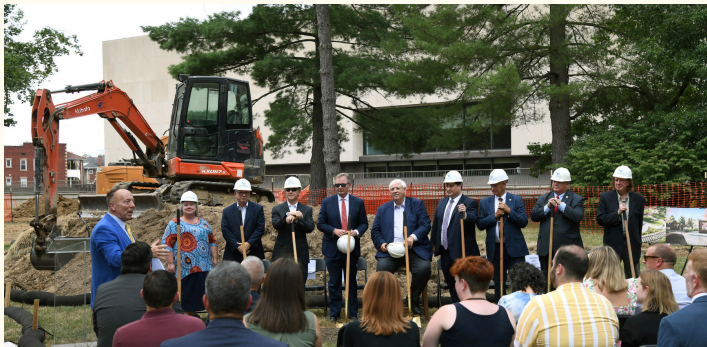
Groundbreaking of the new outdoor exhibit to be installed at the State Capitol.

The two highlighted recent and upcoming events in the state, such as the state commission's participation in the Ripley Fourth of July parade, the 250th Anniversary of the Battle of Point Pleasant, and the addition of Senator Shelley Moore Capito to the National America 250 Commission.