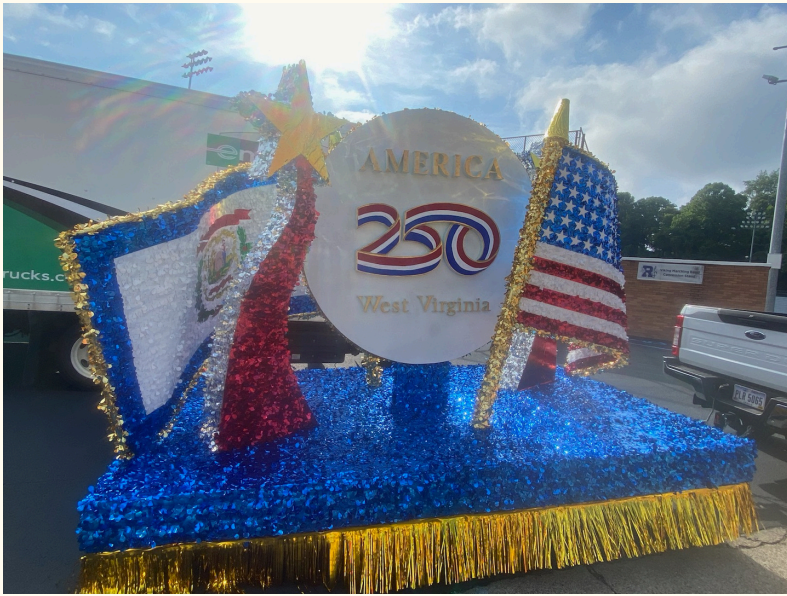
Photo credit: America 250 WV float featured in the Ripley Fourth of July parade, photo courtesy of Aaron Parsons.